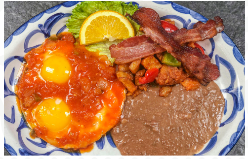
Two fried eggs on a fried corn tortilla topped with salsa ranchera. Served with refried beans, potato tips and Mexican sausage (Chorizo) or bacon. 10.99