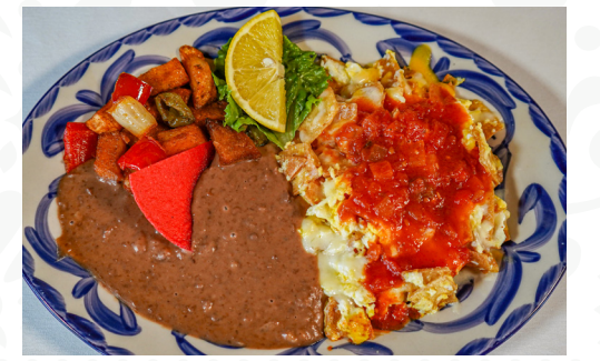
Two scrambled eggs topped with salsa ranchera or salsa verde with spicy hot tortilla bits and topped with cheese. Served with potato tips and refried beans. 10.99