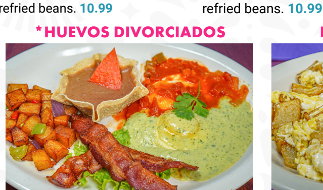
Two fried eggs topped with salsa ranchera and salsa verde, served with potato tips, bacon and refried beans. 10.99